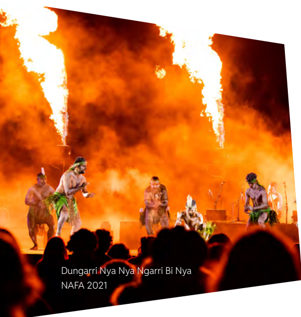
Dungarri Nya Nya Ngarri Bi Nya NAFA 2021